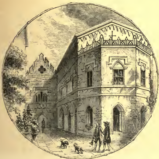
ENTRANCE OF STRAWBERRY HILL.